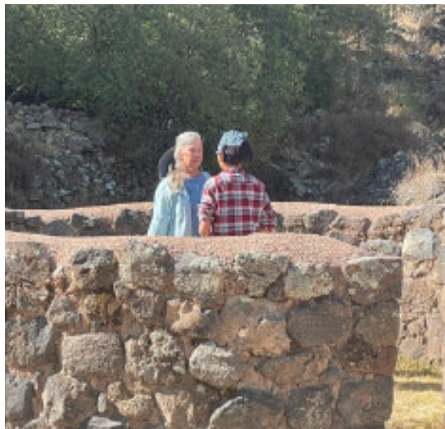
Image from Wiraqocha temple near San Pedro de Cacha. I served as high priestess for my group of journeyers. Notice no flowing robes, no fancy anything and it was the most powerful ceremony ever for me.

I am your guide and I share with you what I've learned. You might not resonate with some of the practices. You might really connect and decide to explore further on your own. Great! My path was carved with the teachings of many, many beings and I trust you'll find the path that suits you. Have fun